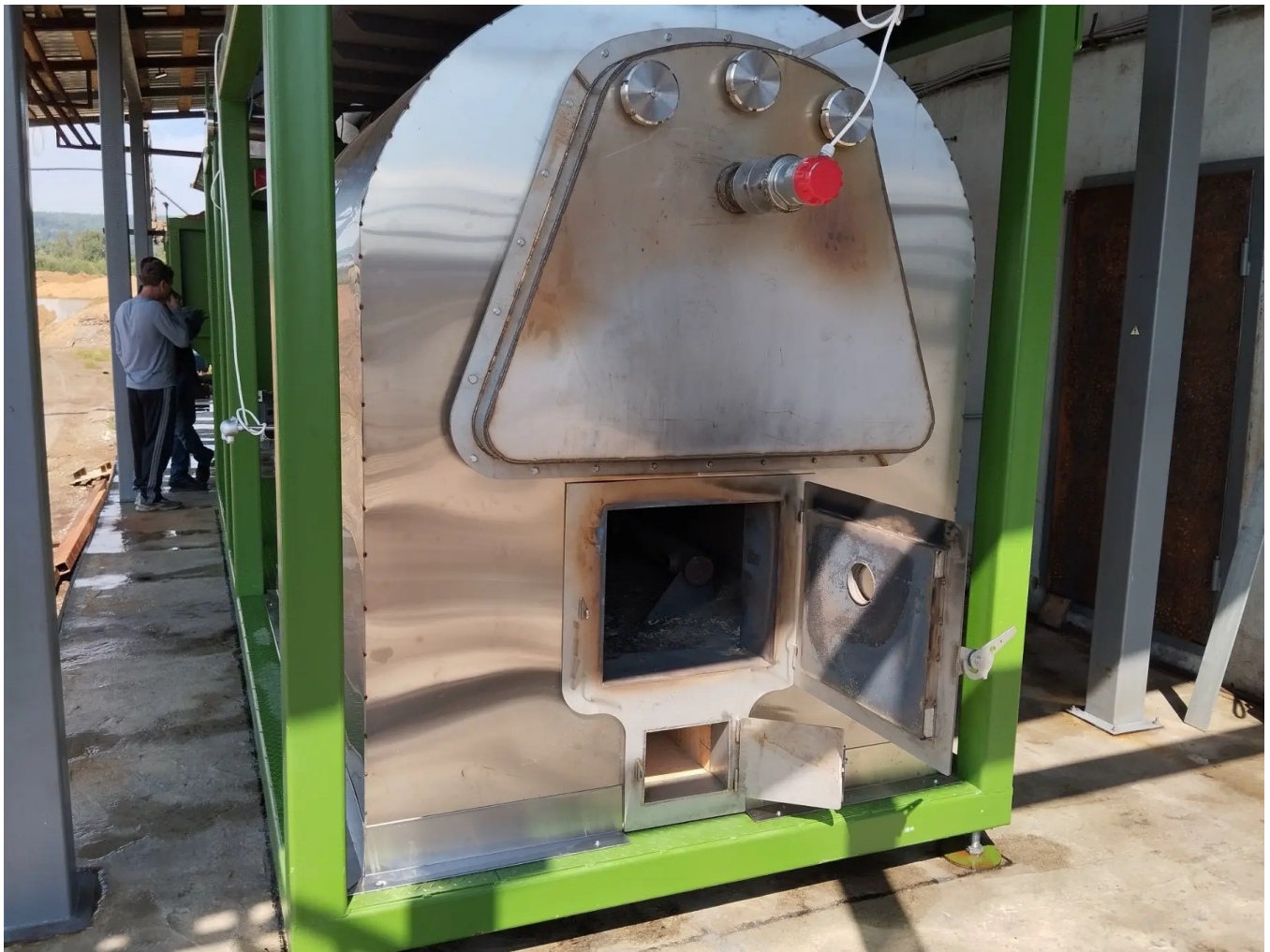
Picture 3. Reactor furnace