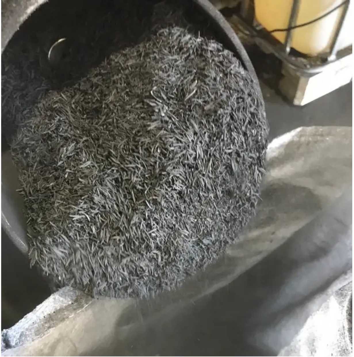
Picture 4. Unloading of final product