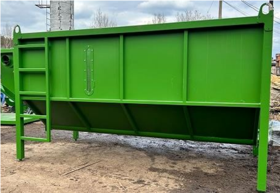
Picture 1. Storage hopper