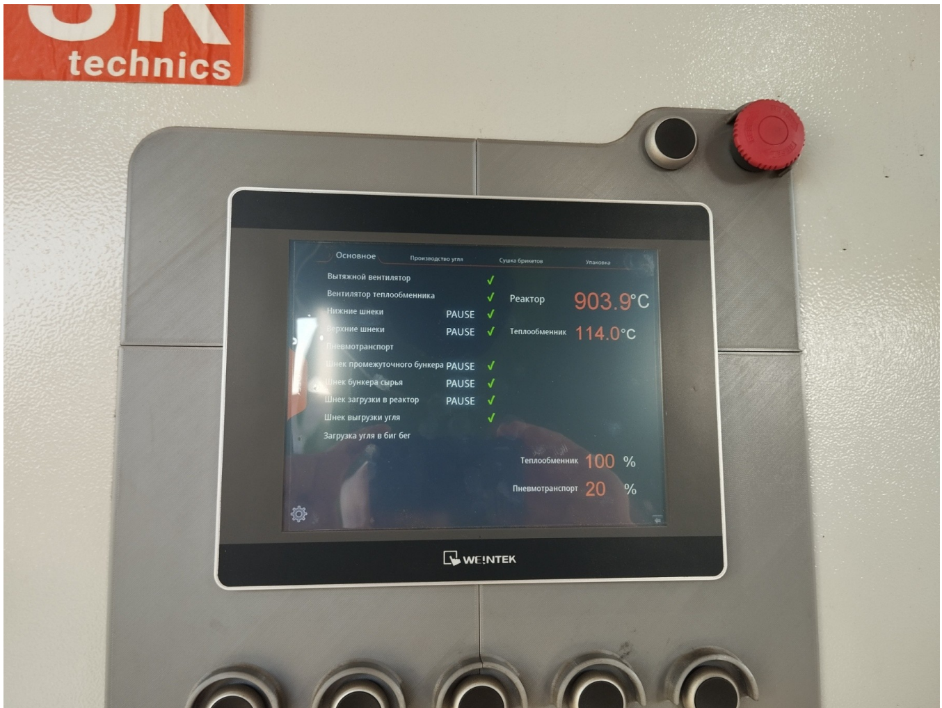
Picture 10. Operator panel with software