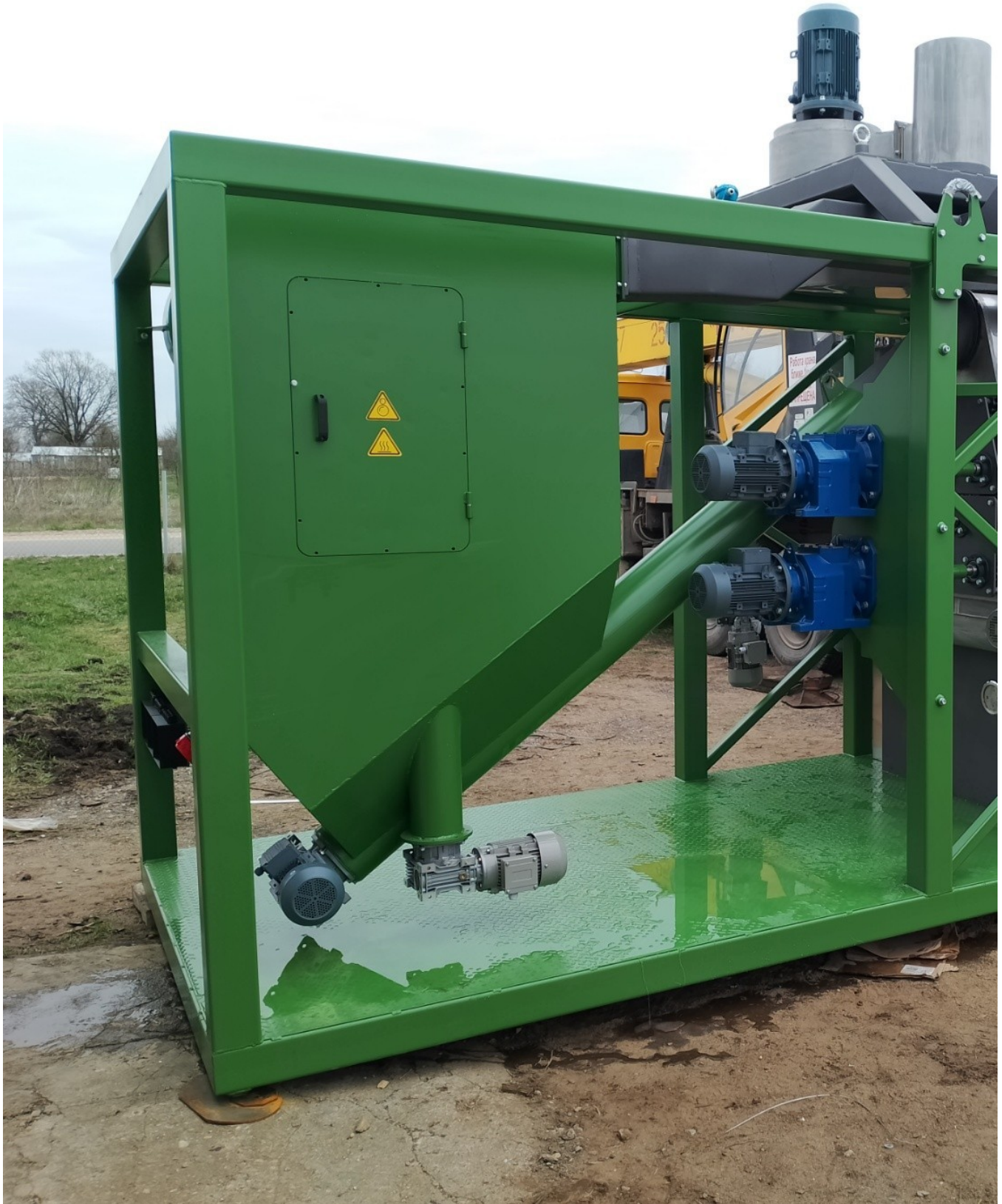
Picture 2. Dryer