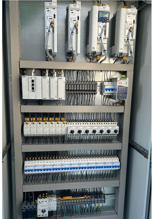
Picture 9. Control cabinet