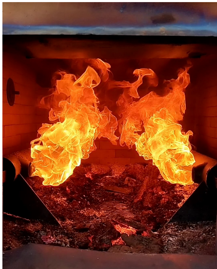
Picture 8. The process of operation of the carbon-burning complex