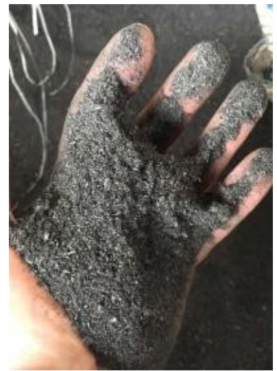
Picture 5. Sawdust. Coal chips from sawdust