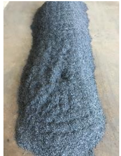
Picture 6. Rice husks. Coal chips from rice husks